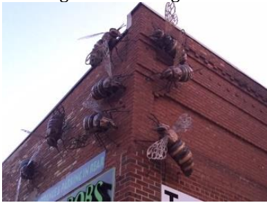
Also, Bees on Broadway !

Down town De Pere, Main street buildings host Bee Art to help bring awareness to honeybees. The ally way is loaded with large bees on the building and there are paintings focusing on bees along the walls.